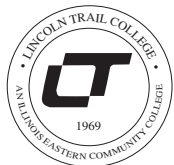
Lincoln Trail College