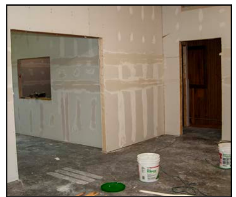
At top, renovations for the new studio include the installation of new walls for the recording booth. At left, the former Upholstery Repair Building prior to construction.