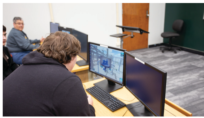
A Lawrenceville High School student uses a Process Technology simulator on a visit to LTC. LHS students also learned about Welding and Broadband Telecom.