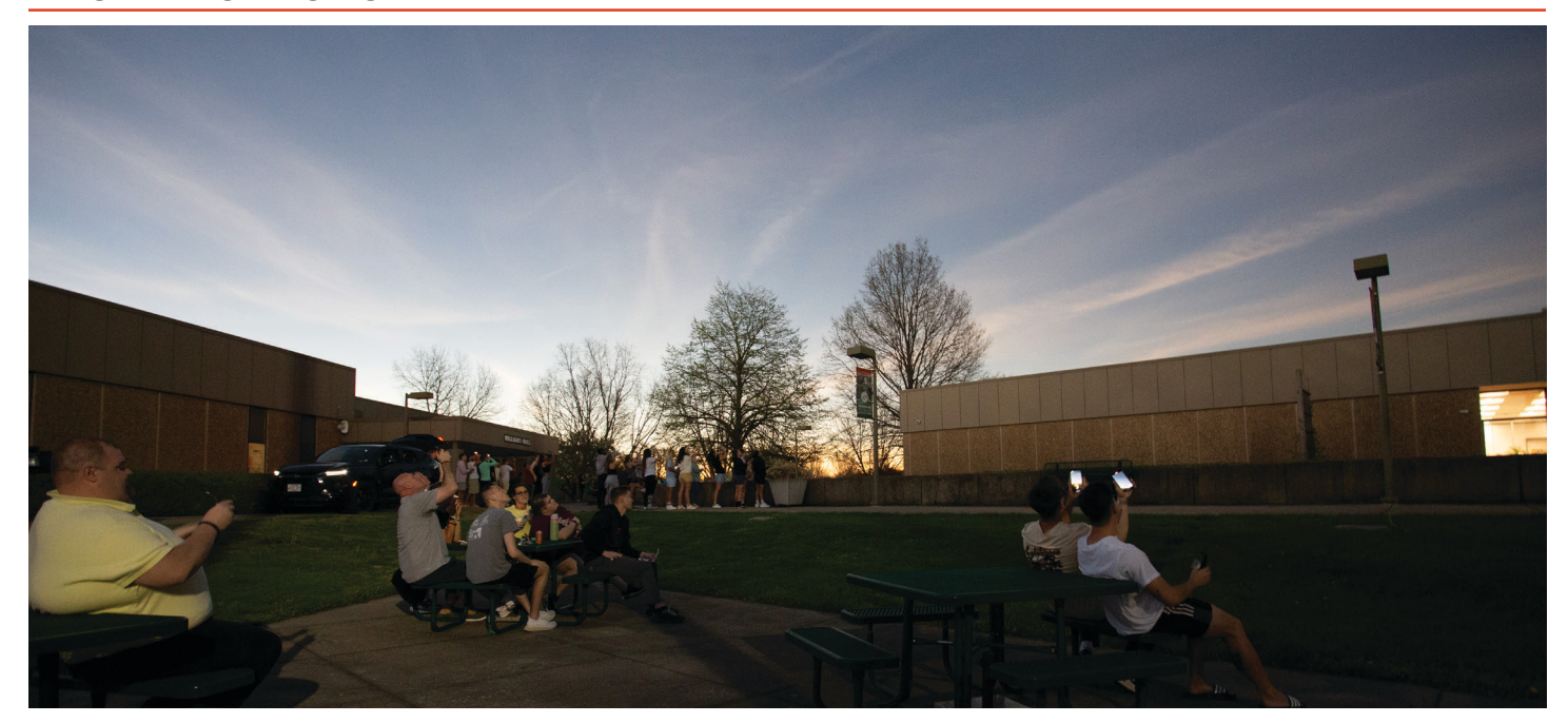
Lincoln Trail College students and employees took part in a once-in-a-lifetime event with the April 8 total solar eclipse.

While the day was an online learning day, there was still no shortage of activity on the campus, which was in the path of totality. The Statesmen Grill offered an eclipse-themed menu. LTC offered eclipse-themed snacks during the event and also played eclipse-themed music.