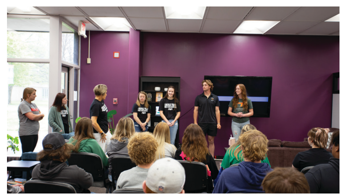
LTC's Student Ambassadors talk with area high school seniors during LTC's Senior Start event \,