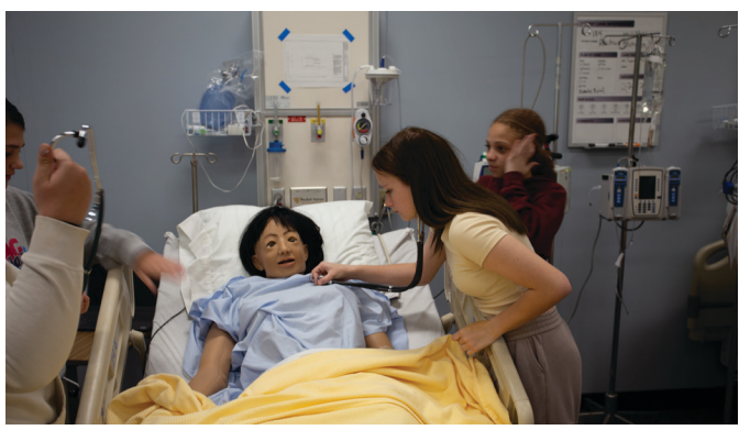
A Nuttall Middle School student listens to lung sounds during a visit to LTC. NMS visited on three separate occasions this spring to learn about different programs.