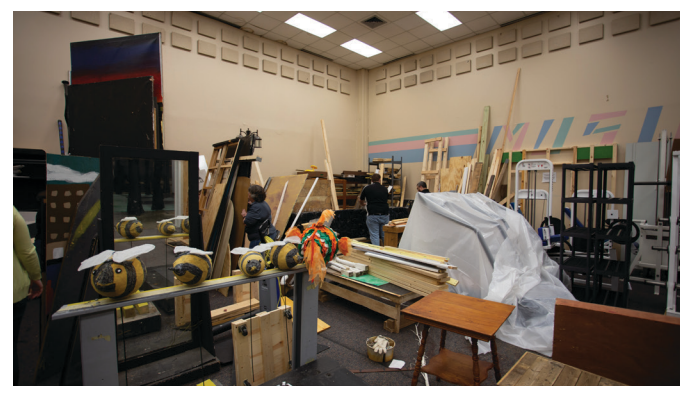
Leadership Crawford County members volunteer to help clean up LTC's performing arts production shop.