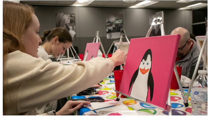
Students and community members painted penguins at a Paint Night event put on by LTC's Student Senate.