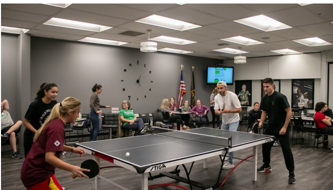
Onlookers watch an intense ping pong game during LTC's Doubles Tournament