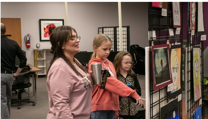
Families admired artwork during an artist reception for LTC's Children's Art Show.