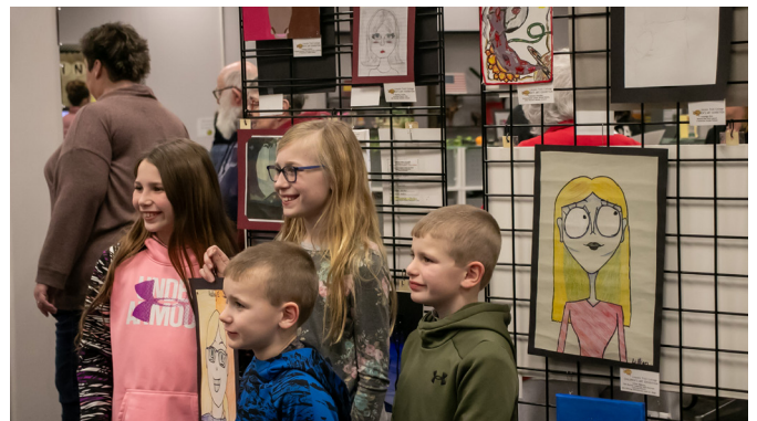
The Children's Art Show featured 86 pieces from local students.