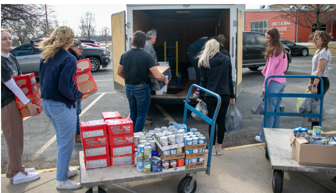
Student Senate members help load up a food donation for Upper Room Street Ministries.