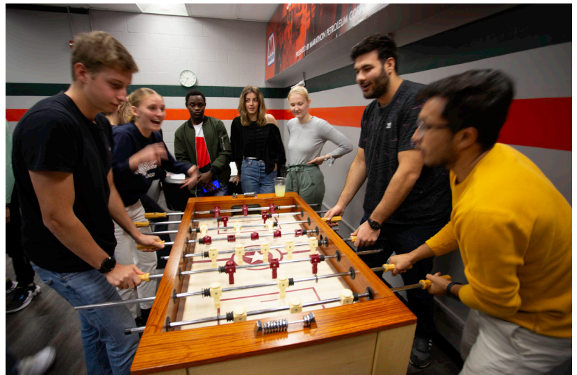
International students bond over an intense game of Foosball in LTC's Student Lounge

This year's International Thanksgiving Meal also fell on International Students Day. The annual day recognizes the contributions of international students to education.