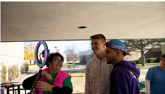
Two students get instructions on how to take a 360 photo during LTC Statesmen Day.