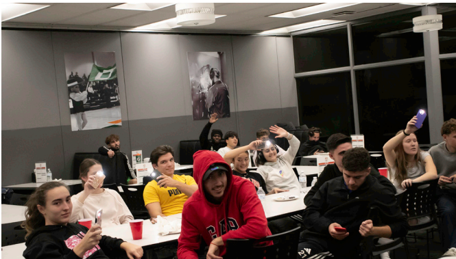
LTC students light up their phones while grooving to the music during Student Senate's Pancake and Karaoke Night.