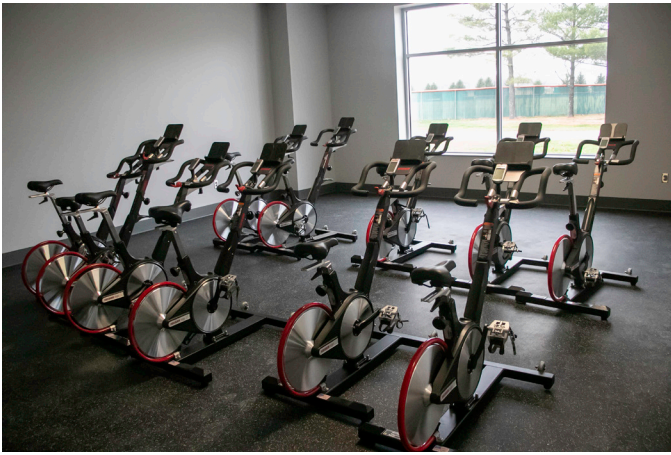
Spin bikes fill one of the CCRC's three fitness studio.

member, you will have an opportunity to set and achieve fitness goals, form relationships, have fun, and make memories that will last a lifetime.