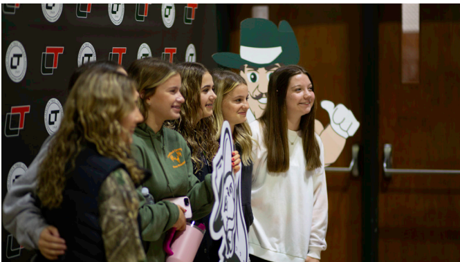
A group of students pose for a picture during LTC's Future Statesmen Day.