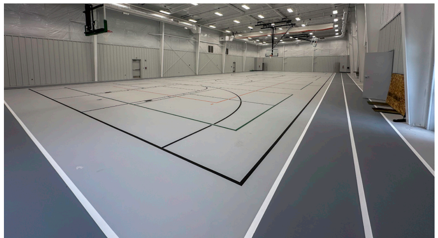
The gymnasium in the CCRC is surrounded by an indoor walking track and features multipurpose sport courts.