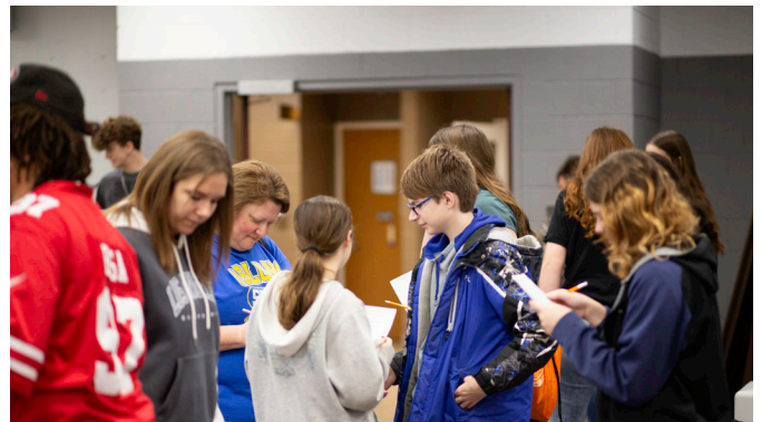
Students start searching for ways to earn a Bingo during LTC's Future Statesmen Day.