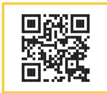
IECC SBDC Webpage QR Code

On August 9th, B&I proudly hosted the inaugural Safe + Sound Conference in Olney. This was a collaborative effort with OSHA and the Illinois Manufacturing Excellence Center, marking the first of its kind in this part of the state. There were approximately 45 people representing over 25 organizations in attendance. B&I recently met with NAL, the City of Fairfield, Fairfield Memorial Hospital, and Crawford Memorial Hospital to assess their training needs and create plans. A license application has been submitted to be able to offer a Cosmetology Certificate as well as a license to offer a Physical Therapy Certificate.