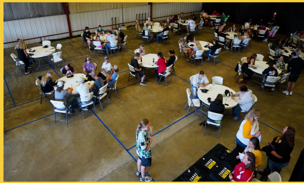
New Students Learning, Mingling and Asking Questions

At the conclusion of NSO, each student was asked to fill out a survey containing questions about their experience and provided an opportunity to give feedback. The NSO Committee will look at the results to continue their effort to provide the most informative, enjoyable orientation moving forward.