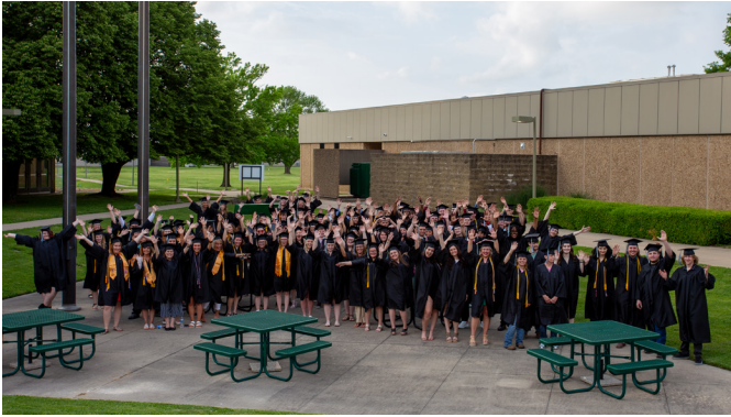
Lincoln Trail College Class of '23 celebrates together.