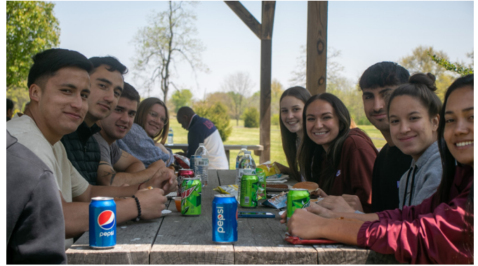
LTC students enjoy a meal together during Craze Daze.