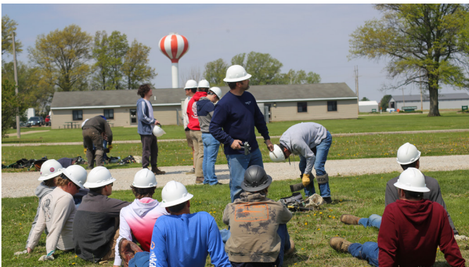
Lincoln Trail College and Frontier Community College students worked together on pole climbing.