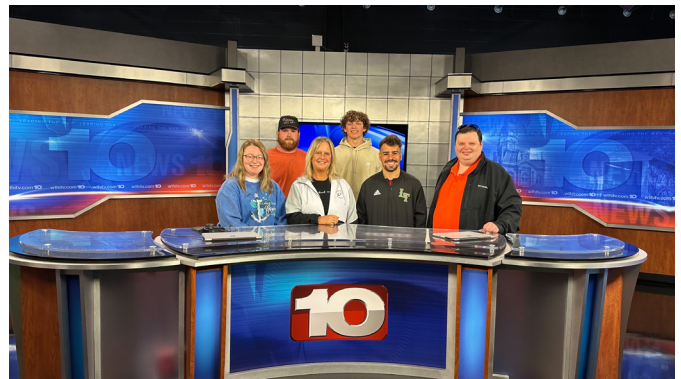
Students in LTC's Student Publications Class had the opportunity to tour WTHI in Terre Haute, Ind.