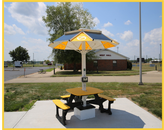
New solar-powered picnic table outside of the Adult Education building at FCC

IGEN was formed in 2008 through an inter-governmental agreement with support from the Department of Commerce and Economic Opportunity, the Governor's Office, and the Illinois Community College Board. Their mission is to provide a platform for collaboration among all Illinois community colleges and their partners to drive the growth of the clean energy economy and green workforce.