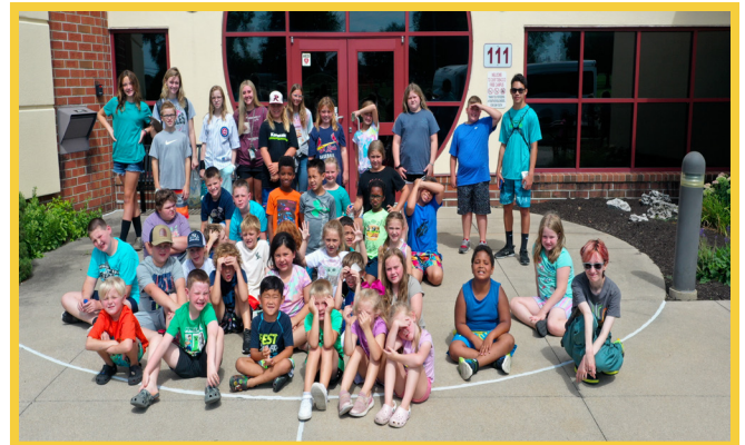
Kids in Motion outside of Cox Hall