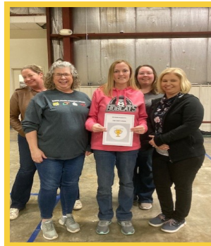
Second-place scavenger hunt team