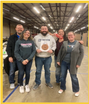
First-place scavenger hunt team