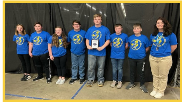
Geff team, second-place

The Wayne County Scholastic Bowl took place on Friday, April 14th at FCC.