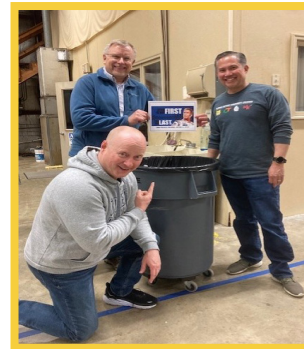
Third-place scavenger hunt team