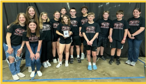
Cisne team, first-place winners