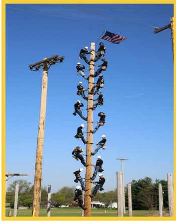
Participants lining up on the pole before the National Anthem