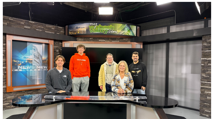
Student Publications students had the opportunity to tour WTWO/WAWV to learn about broadcast journalism.