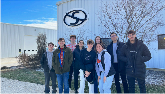
Lincoln Trail College FBLA-C students got the opportunity to tour Flying S and learn more about their operations.