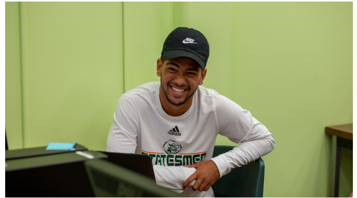
ABOVE: Students taking the Introduction to Teaching class had the chance to interact with International students at Lincoln Trail College. The students shared things like what it was like growing up in their respective countries, differences in cultures, and foods from their countries. The students proposed having an event where they would make their favorite foods from their countries.