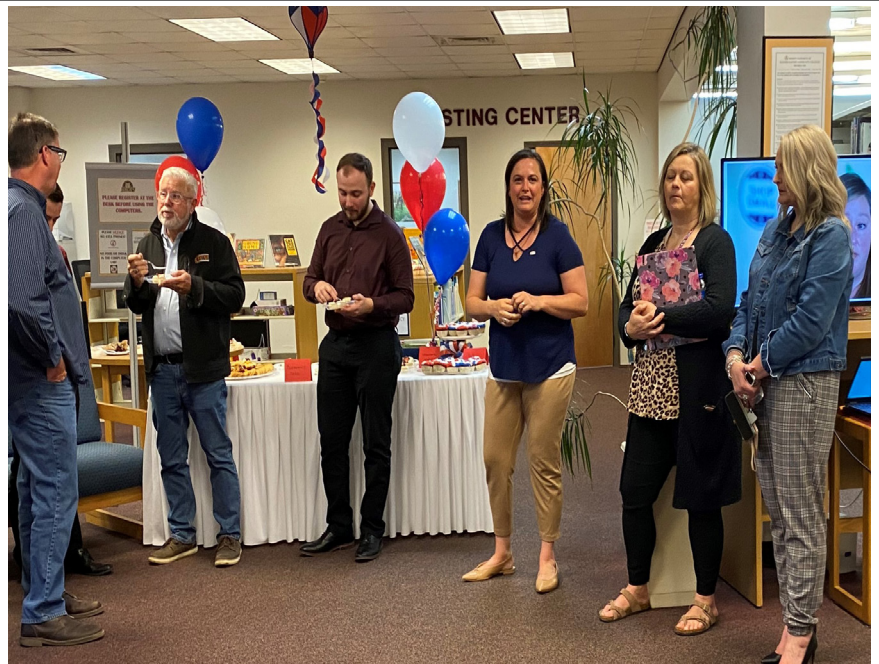
SBDC open house attendees

Guests enjoyed networking and light refreshments and received handouts with SBDC information. Additionally, several existing and emerging businesses made appointments to return for services. The open house was hosted in Elizabeth C. Cox Hall, where the SBDC office is located.