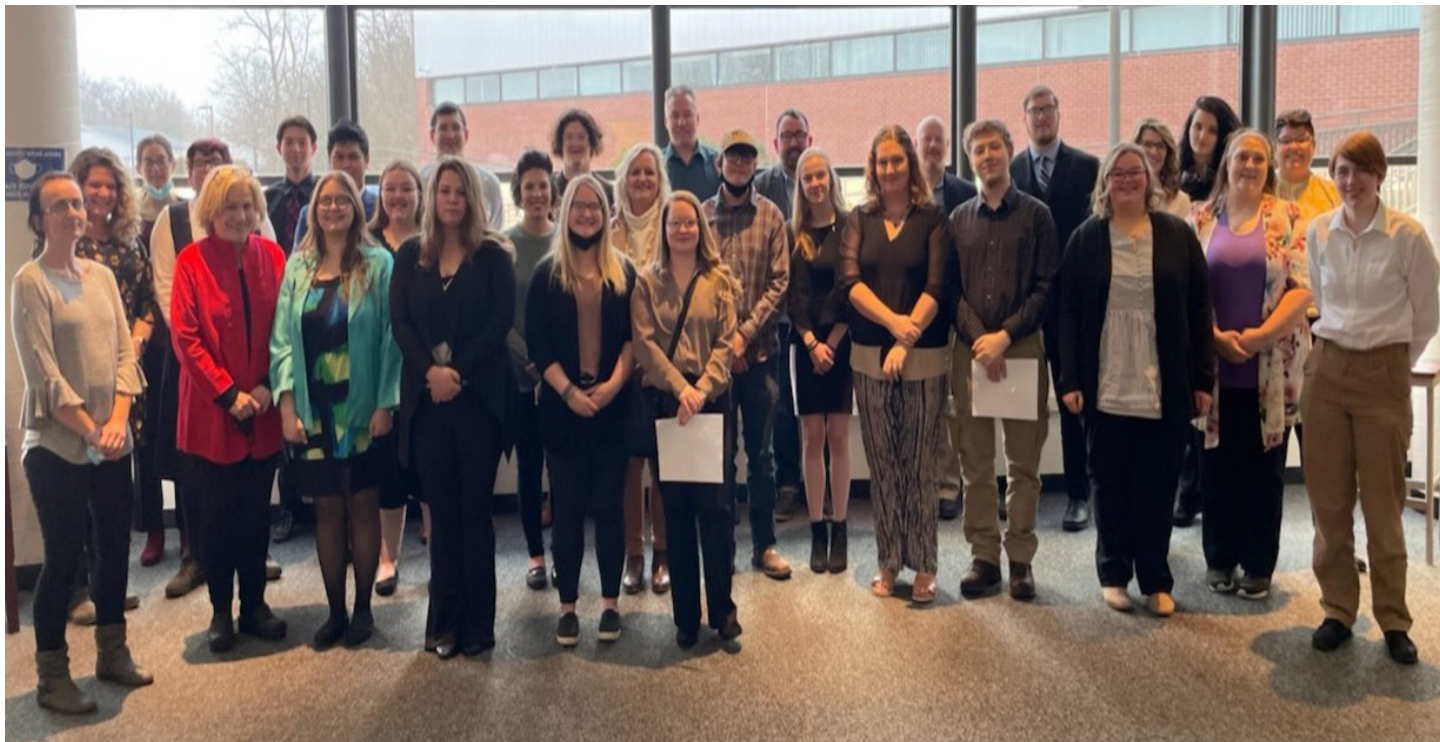
IECC students at the Business Etiquette Workshop