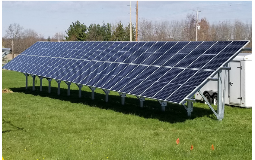
Installation of the first section of solar panels

Construction is underway on the 45kW solar array on the campus of Frontier Community College. The project is funded by a $120,750 grant from the Illinois Green Economy Network (IGEN). Located north of the Workforce Development Center (WDC), the solar array will provide both green energy to help power the campus and educational opportunities to students in the Automotive Technology and Electrical Distribution Systems programs.