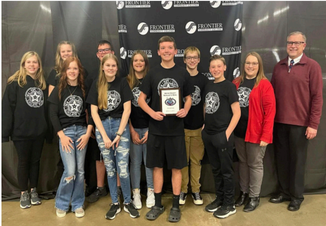
Scholastic Bowl Winners from New Hope Grade School

On Friday, April 1, Frontier Community College hosted the Wayne County Junior High Scholastic Bowl. Six teams were on campus for this annual event. Scholastic Bowl competitions bring quite a following, as many parents and grandparents attend in support of their student. New Hope Grade School was the winner of first place, going undefeated the entire day. Second place went to Cisne, and Wayne City secured third place. The other participating schools were Fairfield, Jasper, and Geff. The local radio station, WFIW, aired the evening matches in a live broadcast.