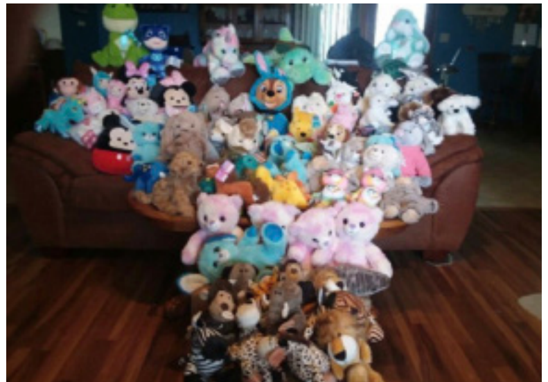
Donations for area pediatric units

SNA has fourteen active members. Membership is open to students who are currently enrolled in the Associate Degree in Nursing program at Frontier Community College.