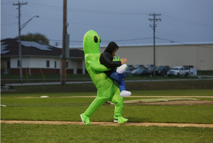
Photo of 2019's Monster Mash

This Halloween weekend, Frontier Community College will become extra Spook-tacular, thanks to a pair of on-campus events. On Friday, October 29 from 4-6pm, the parking lot in front of the Bobcat Den will host a Trunk-or-Treat event that will allow local kids to put on their costumes and get sweet treats from various on-campus organizations. This event is bound to be full of cute ghosts and scary goblins threatening tricks if their hunger for treats can not be satisfied.