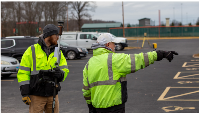
Surveying begins for the Crawford County Recreation Center.