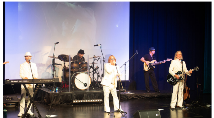
Bee Gees tribute Stayin' Alive performs in the Zwermann Arts Center Theater as a part of the LTC Foundation Concert Series.