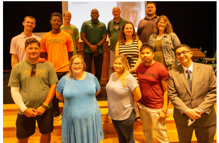
New faculty and staff members were introduced during the Faculty/Staff Workshop.