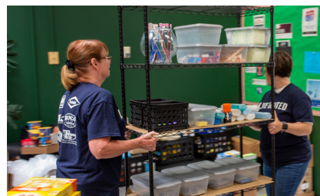
Volunteers with the United Way of Crawford County came to Lincoln Trail College on July 23 for a Day of Caring event. The repainted the LTCares Food Pantry and helped reorganize it. The Day of Caring brings together energetic volunteers to help community organizations throughout Crawford County with projects that they might not otherwise be able to complete.