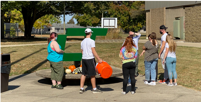
Members of Student Senate decorate the LT statue in the Triangle for Fall.