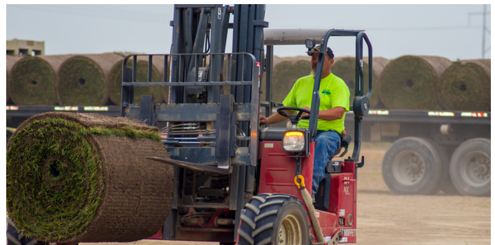
A worker transports sod for Statesmen Park.