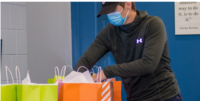
Student Senate makes care packages for students in quarantine. The packages were handed out with contactless delivery.