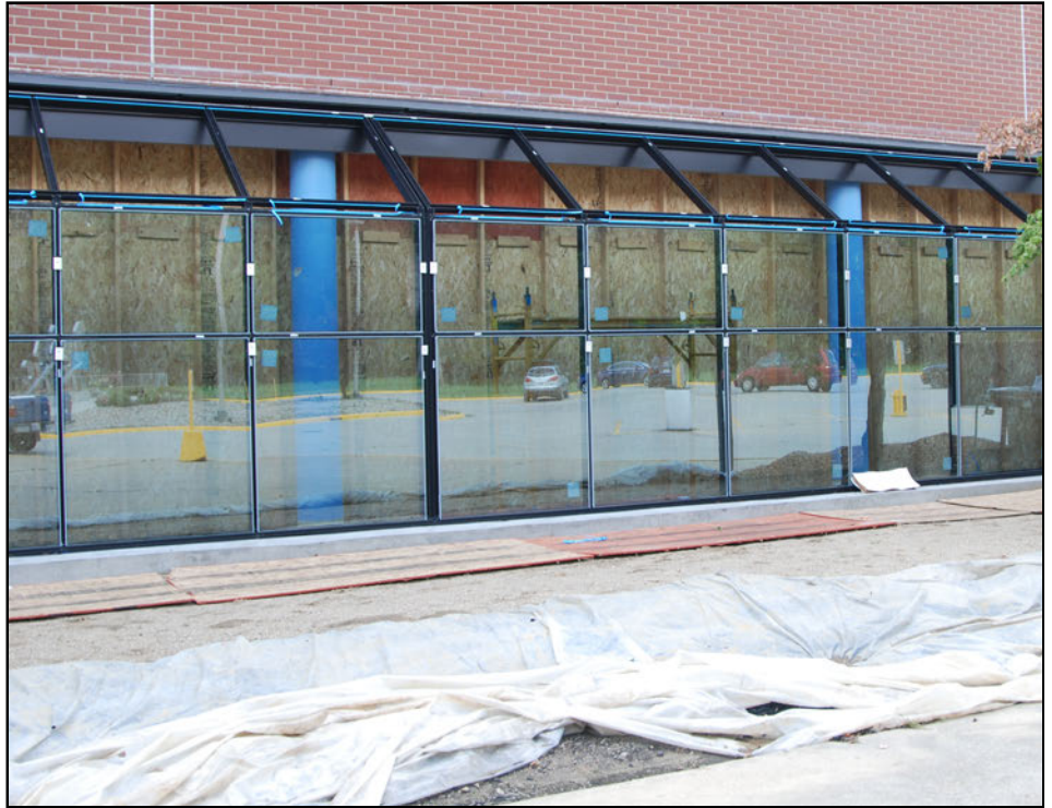
Renovations have been underway this summer on the atrium in the Dr. John D. Stull Performing Arts Center. The work included replacing the original glass and floor tiles.