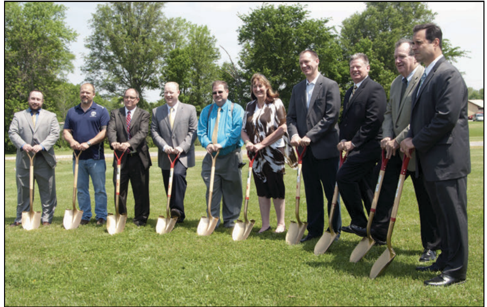
A groundbreaking ceremony was held May 21 for OCC's new Collision Repair Technology Center.