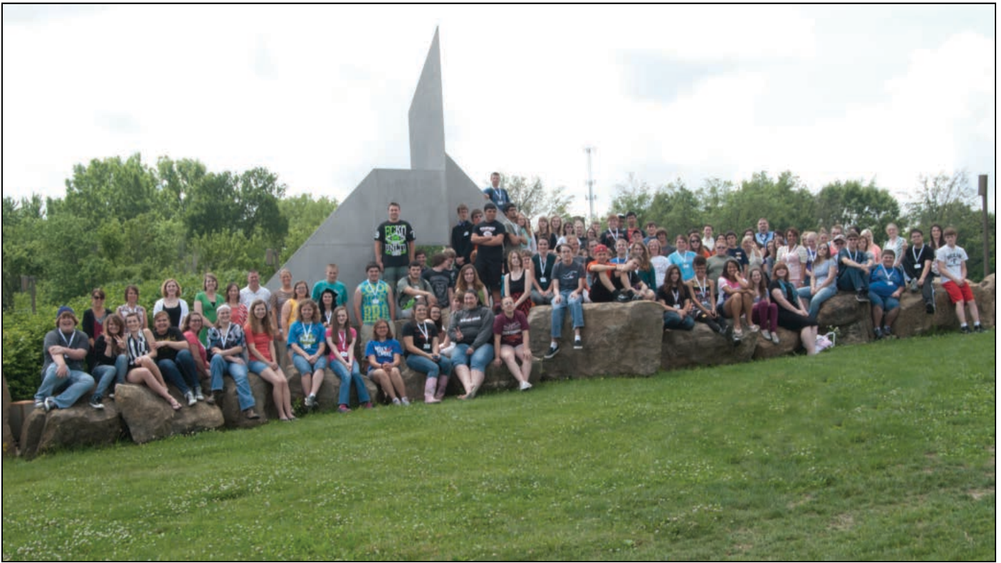
Illinois Eastern Community Colleges TRIO Upward Bound is celebrating 25 years of service. Pictured are the TRIO Upward Bound staff and students.