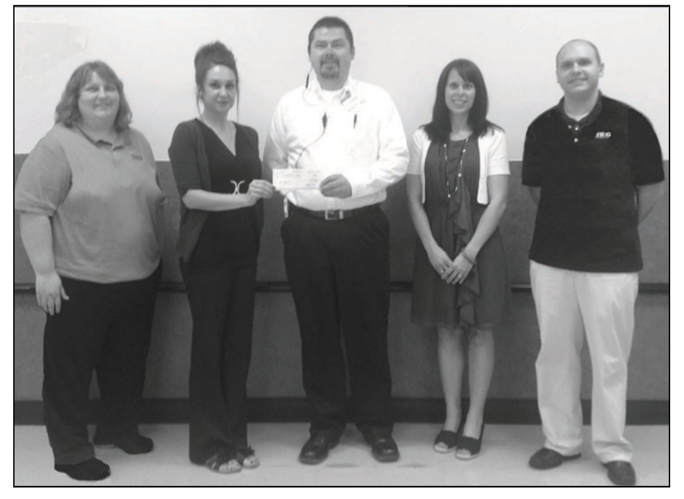
The Illinois Eastern Community Colleges TRiO Upward Bound program recently received a $2,500 grant from the Walmart Foundation's Local Community Contribution Program. The money from the Olney Walmart will be used to provide essential items necessary for college-bound seniors to be successful in post-secondary education.

Application for admission to the IECC TRiO Upward Bound program is open to students in a specific target area which includes, Crawford, Edwards, Jasper, Lawrence, Richland and Wayne counties. The Upward Bound program currently serves a total of 140 students at eight local high schools. Upward Bound - West serves students at the East Richland, Edwards County,