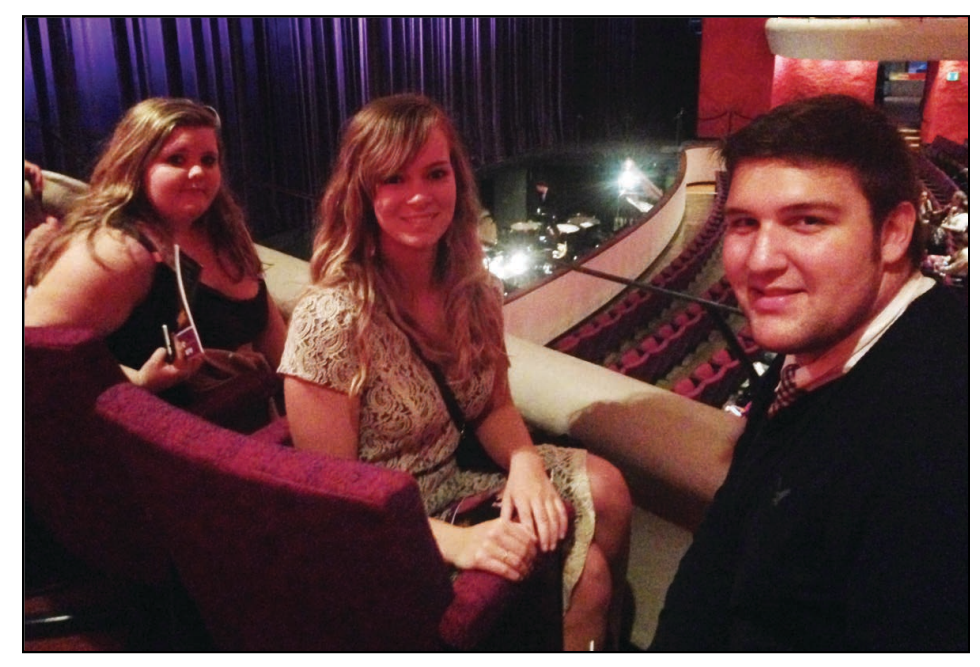
Students in the OCC Music Department attend the opening night performance of "The Marriage of Figaro" at Indiana University in Bloomington. The opera was produced by the IU Jacobs School of Music.

"I really enjoyed getting to know the students in the OCC Music Department better and getting to