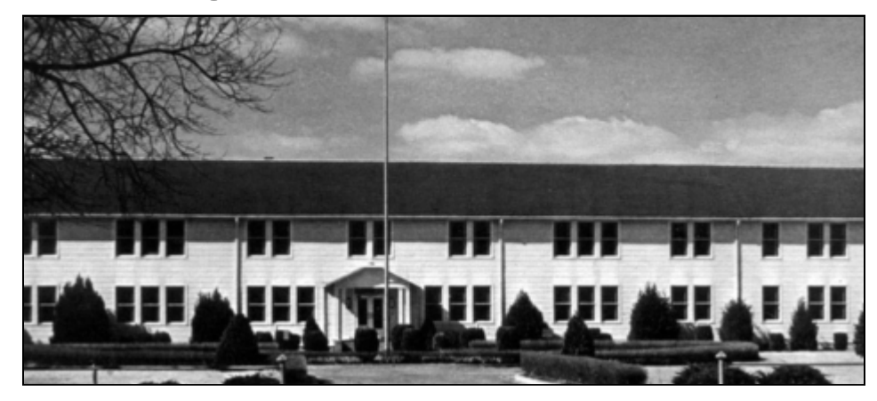
The former Pure Oil Building housed Olney Central College from 1963 until the completion of Wattleworth Hall in 1974.

Cookies and punch will be served prior to the formal program which