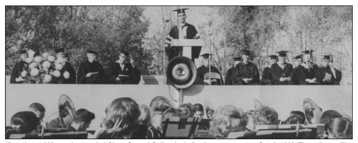
More than 1,000 people attended Olney Central College's dedication ceremony on Oct. 6, 1963. The college will host its 50th Anniversary Celebration from 1:30 to 3:30 p.m. on Wednesday, Oct. 23 with the formal program to begin at 2 p.m. in the Student Union.