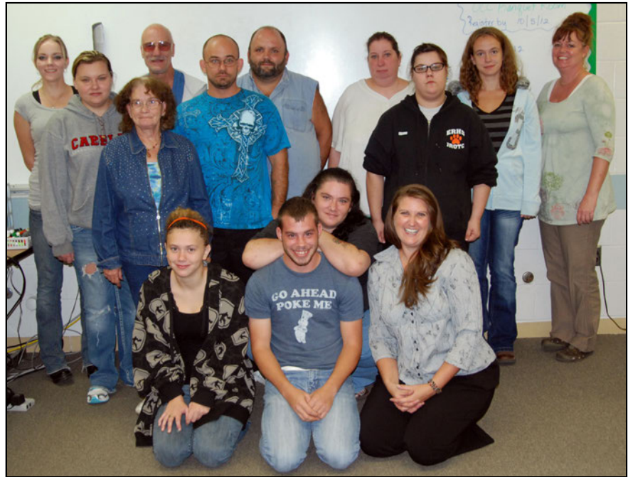
Olney Central College celebrated National Adult Education and Family Literacy Week Sept. 10-16. The college's Learning Skills Center serves an average of 300 adult students annually. Every year some 30 to 40 students earn their GEDs. Pictured are Olney Central College ABE/GED students and instructors, who attended a pizza party held in conjunction with the celebration.

OCC's adult basic education classes are helping to prepare him for college courses.