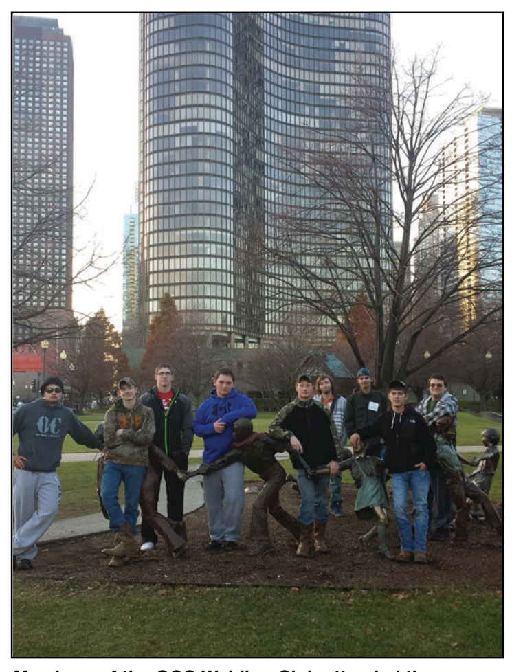
Members of the OCC Welding Club attended the FABTECH Expo on Nov. 19-20 in Chicago. The students had the opportunity to see the latest innovations in the field and to watch demonstrations.