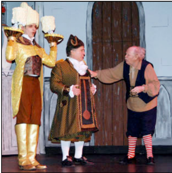
The OCC Theatre's production of "Beauty and the Beast" set attendance records with every performance being sold out.