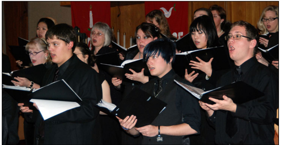
Members of the OCC Community Chorus present their 2011 concert. This year's performance will be at 7 p.m. on Dec. 11 at Immanuel United Methodist Church in Olney.