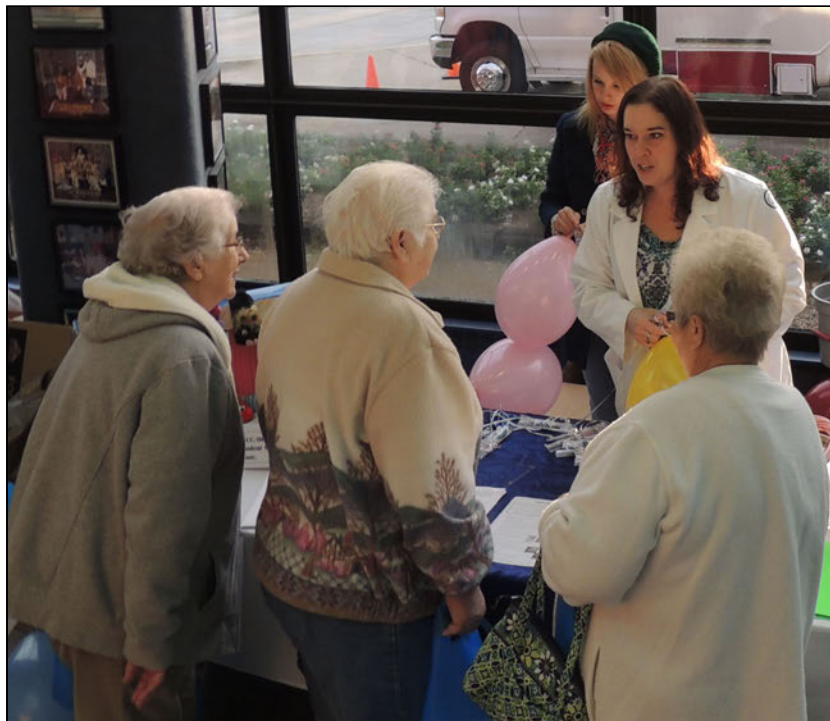
The Olney Central College Student Nurses Association participated in the 2012 OCC/Richland Memorial Hospital Health Fest last month. Students offered free blood pressure checks and presented information on the importance of proper hand hygiene.