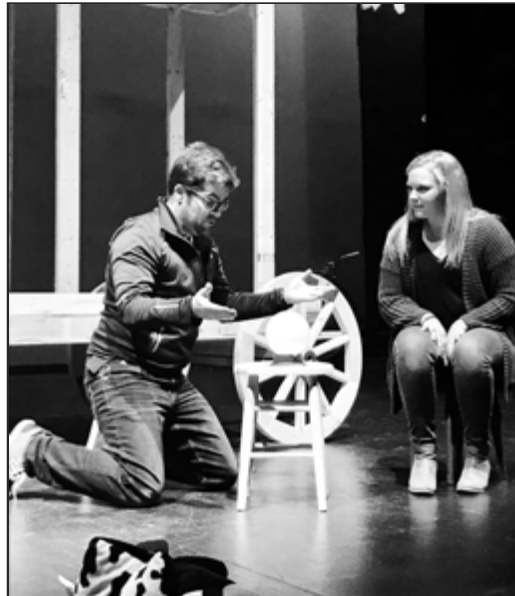
Rehearsals are underway for The Wizard of Oz , which will feature the new dual projection system in the Dr. John D. Stull Performing Arts Center.

Tables will be located outside the Nursing Classrooms.