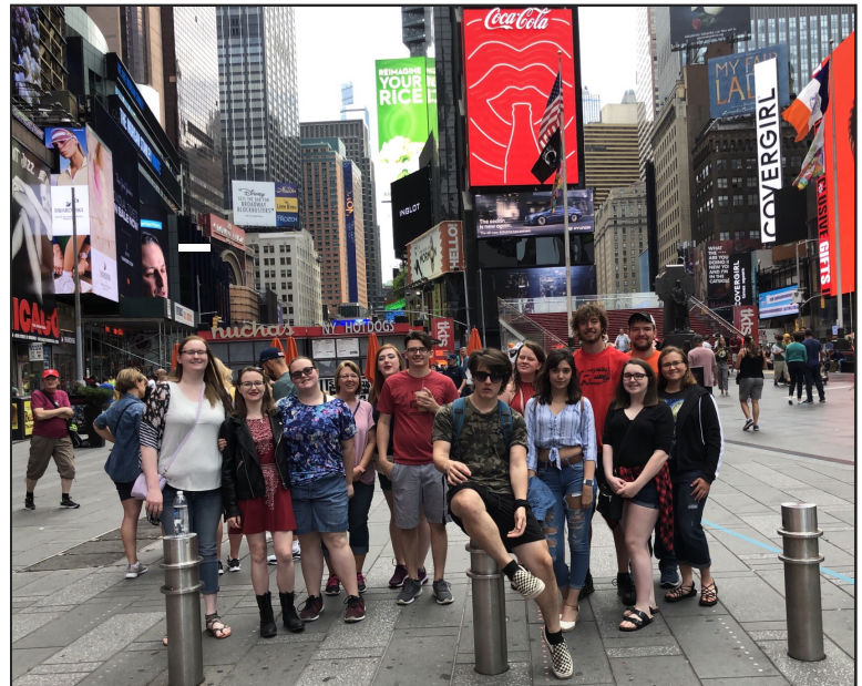
In addition to performing at Carnegie Hall, OCC students enjoyed sightseeing in Times Square and Central Park. The students also visited the Metropolitan Museum of Art.