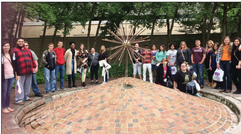
Students in the TRIO Student Support Services Program visit the University of Evansville.

All services are free of charge to all participants. Visits to four-year universities and cultural trips are some of the most popular benefits offered to the students. The opportunity for students to travel outside their own geographic regions has opened the eyes of the stu-