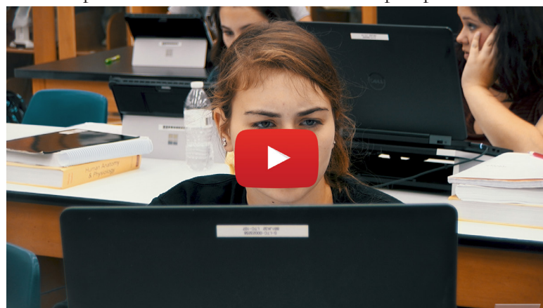
A thumbnail of LTC’s Virtual Tour video available on YouTube

Another problem to tackle was how to show prospective students what Lincoln Trail College looks like. The Governor’s