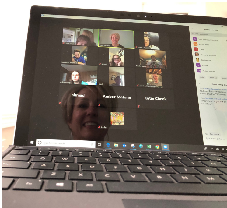
Prospective students interact with current LTC students and staff during the virtual Senior Blitz Day