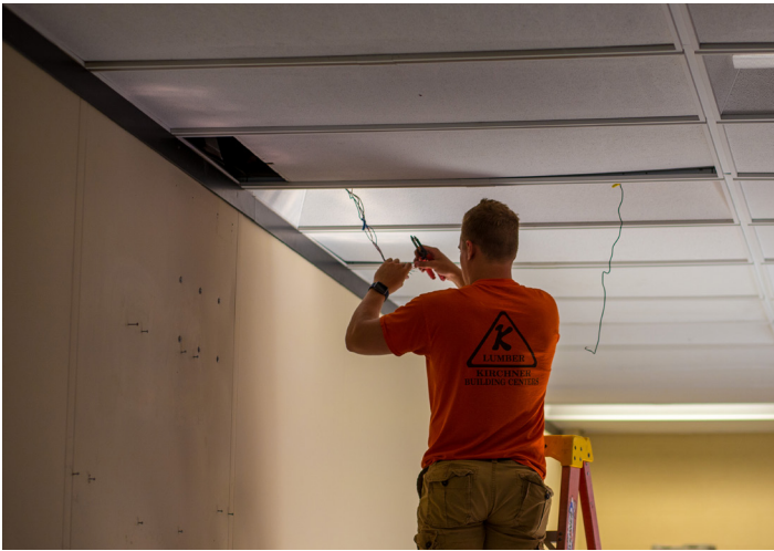
A contractor from Central State Construction works on replacing lights in Williams Hall. Labor was donated through the PPP loan program.