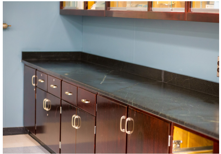
New counter tops were installed in the Anatomy Lab in Williams Hall. The new counters match student work stations installed last year.