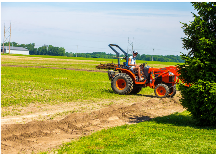
A contractor digs trenches as work gets underway to install irrigation at Statesmen Park.