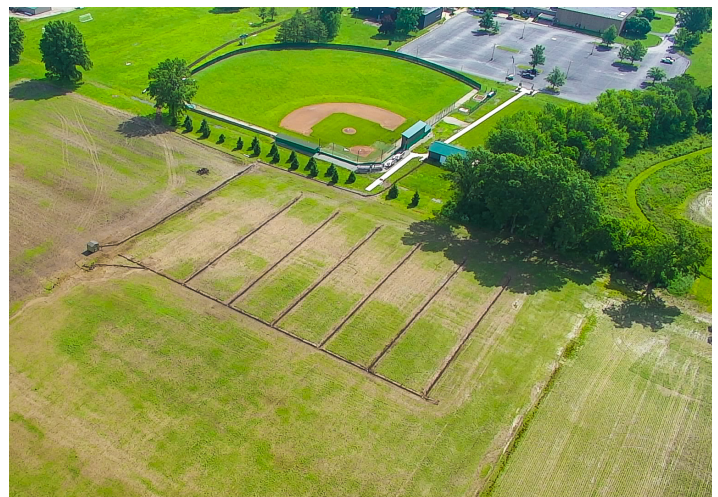
Once the irrigation work is completed field work will begin to build the competition field and the practice field to prepare them for the fall season.