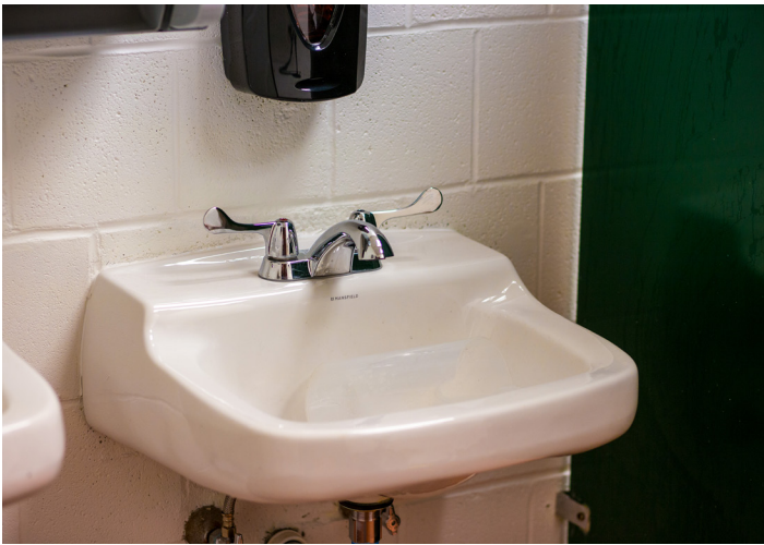
Restroom fixtures were upgraded in Williams Hall.