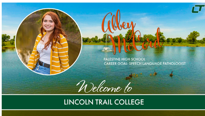
An example of a “Welcome to LTC” graphic found on LTC social media channels. Incoming students provided information to participate in the series.