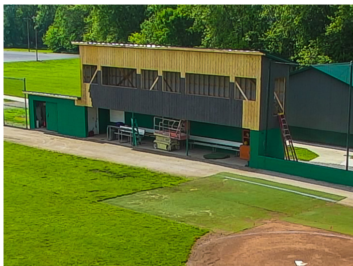
Construction work is ongoing to build a new press box at Parker Field. The project is one of several recent projects at LTC's baseball facility.