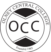
Olney Central College