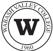
Wabash Valley College

IECC District Office 233 East Chestnut Street Olney, IL 62450-2298 618/393-2982 Toll Free: 866/529-4322