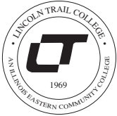
Lincoln Trail College