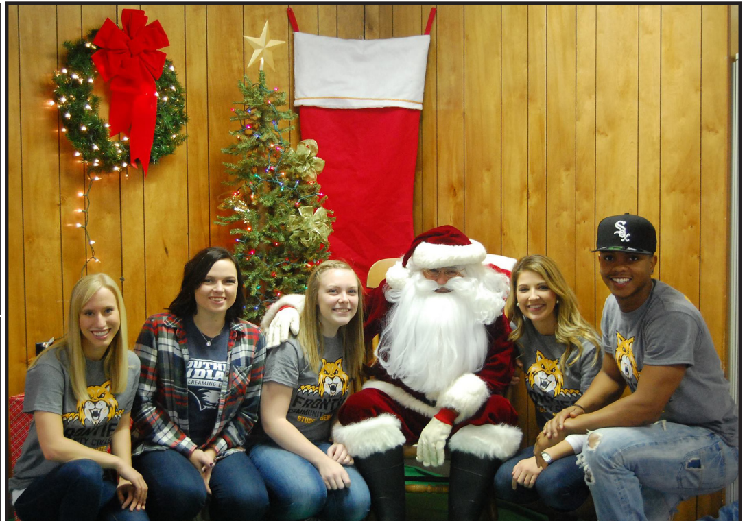
The 2016 Breakfast with Santa, sponsored by the Frontier Community College Student Senate Club, was held on Saturday, December 3 at Bob Boyles Hall on FCC's campus. Several youngsters from around the area attended and enjoyed pancakes, making a craft with Santa, and taking their picture with Santa Claus.