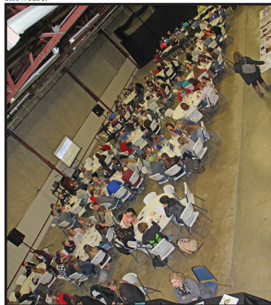
Below: Approximately 130 students filled the Workforce Development Center on November 16 for the annual Program Showcase.