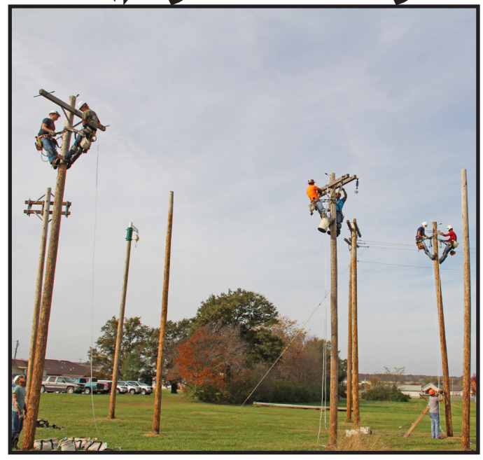
Students in the Electrical Distribution System have nearly mastered climbing poles at this point in the semester. Recently the students learned how to hang a set of doubles, as demonstrated above.