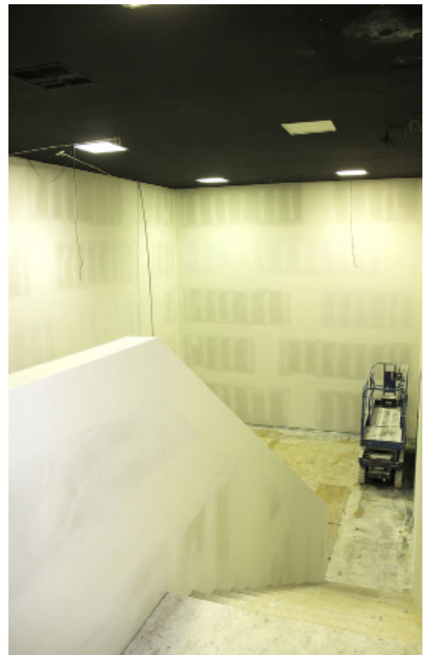
Drywall has been installed and the student lounge is ready for a coat of fresh paint. The wooden floor will be refinished. (above)