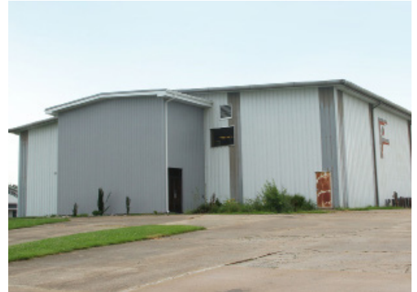
The west wall has been rebuilt, including grey, metal siding.