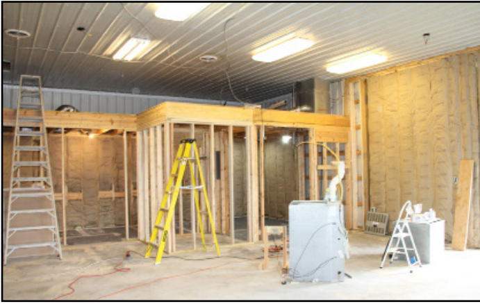
The Bobcat Den Coffeeshouse - the walls and ceiling will be drywalled. Sinks, counters, storage area, and ice machine will be installed.

Remodeling continues at the Bobcat Den fitness center. The lower level will house the coffeeshouse/student lounge and a weight room. The upper level will house the exercise room, office space, and locker rooms. The goal is to have it ready in August for the fall 2015 semester.