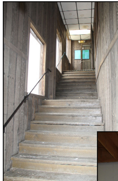
Left: West door entry. Stairway to be removed and rebuilt by Construction Technology students. Windows will be framed in and walls and ceiling will be