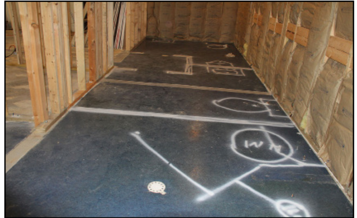
Two restrooms (men/women) and the furnace room with ice machine.