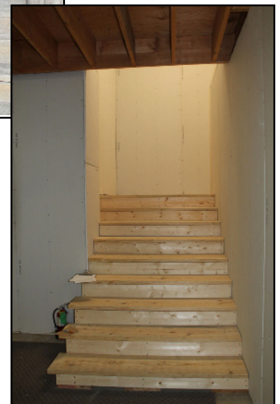
Right: Indoor staircase was rebuilt by students enrolled in the Construction Technology program.