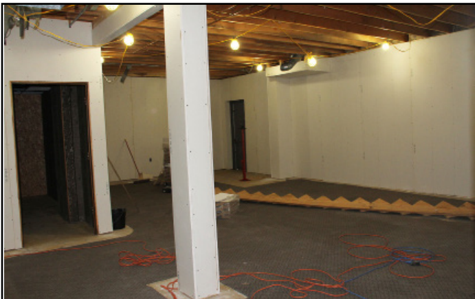
Above is the weight room. Drywall is up and waiting on crew to do the taping and mudding. Below is the exercise room that has been painted and carpet removed.