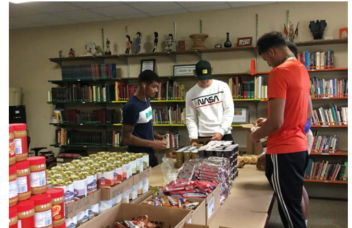
Men's basketball players help pack food for the Crawford County NOW program