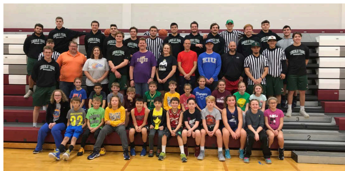
Baseball players help out with the Robinson Elks Hoops Shoot

Baseball players have been involved in many different things ranging from serving as instructors for the 4th-