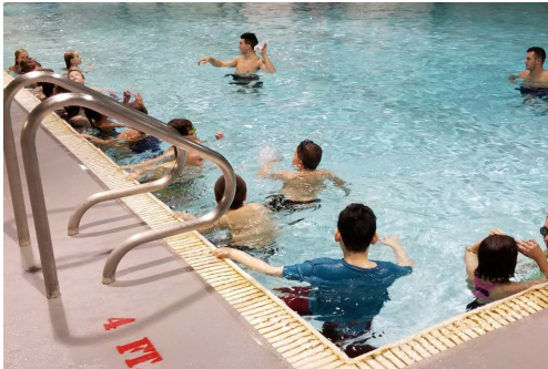
Baseball players work with students in the 4th grade swimming program