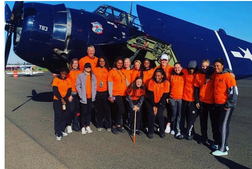
The women's basketball team poses in front of a plane at the Crawford County Air Show