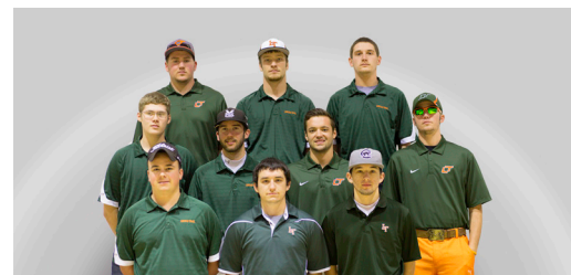
LTC Golf Team